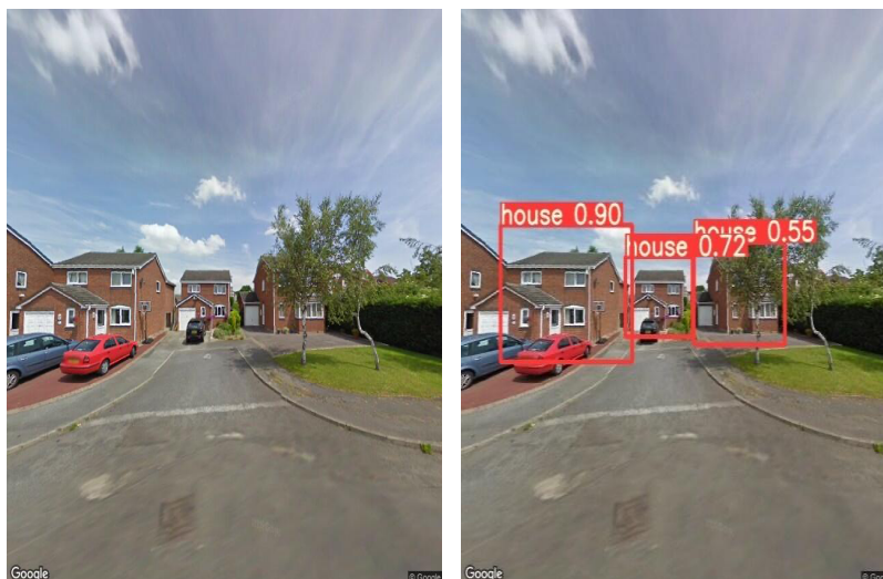
Figure 1. Example GSV image (left); Detection results for the example image (right)

3.1.2. Google street view images. With the full addresses recorded in the EPC, it is possible to query the GSV images through a helper API. The API uses geo-coordinates or full addresses detailed to house numbers to extract the target GSV images with user-controlled photo specifications. An example of GSV obtained for the case study area is shown in the left image in Figure 1. To reduce the amount of irrelevant visual information, an object detection algorithm, YOLOv5, is applied to the extracted images.