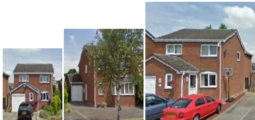
Figure 2. Example cropped images from multi-detection

Once the houses in each GSV image are detected, these houses are saved as individual images as Figure 2. However, as the queried property should be a single building, it is necessary to select one of them as the target property when multi-detection appears. This step has taken the patterns found for houses' energy performance in the same neighbourhood, discussed in Section 2 [5], into consideration, so even if the properties next to the actual queried house are selected for prediction, the bias should be limited. These detected images in various sizes provide the possibility to determine the target house for the following energy performance prediction. If multiple houses are detected in the same image, the largest house detected is used for the following prediction.